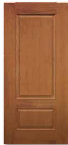
3/4 TWO PANEL OAK