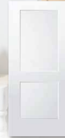
*2P SHAKER SMOOTH