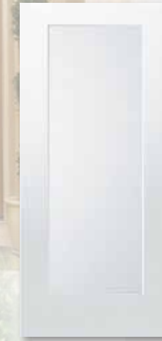
*1P SHAKER SMOOTH