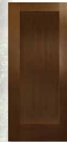
*1P SHAKER FIR