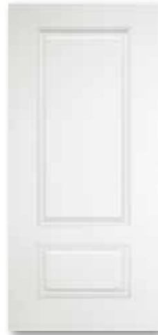
3/4 TWO PANEL SMOOTH