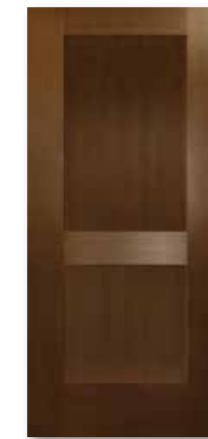
*2P SHAKER FIR