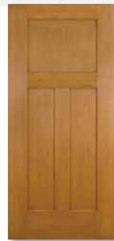
HERITAGE CRAFTSMAN FIR