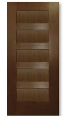
5P SHAKER FIR