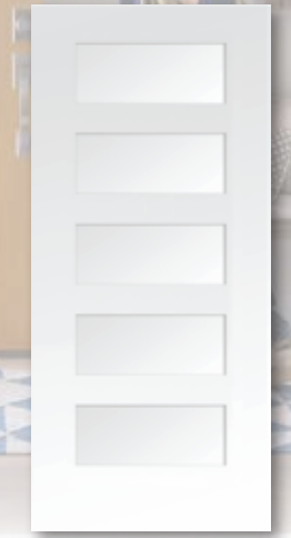
5P SHAKER SMOOTH