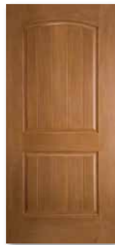
2P CAMBER TOP PLANKED MAHOGANY