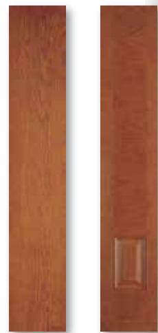
FLUSH OAK 1P OAK