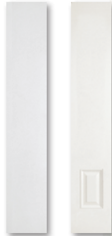
FLUSH SMOOTH 1P SMOOTH