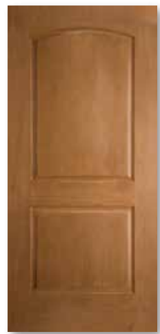
2P CAMBER TOP MAHOGANY